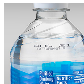
Food and beverages